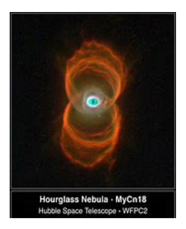
Figure 3: Hourglass Nebula

Mentioned in the above entry is the infamous Hourglass Nebula, which is pictured below for reference: