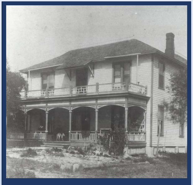
The Constance D. Hunter Historic Pacetti Hotel Museum was a fishing hotel in the 1800s that has become a historic house museum listed on the National Register of Historic Places.

Our non-profit preservation association is looking for enthusiastic students interested in learning the various roles involved in managing and operating these historic sites.