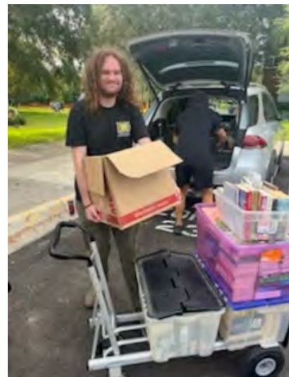
(Above) Student volunteers sorted and packed books.