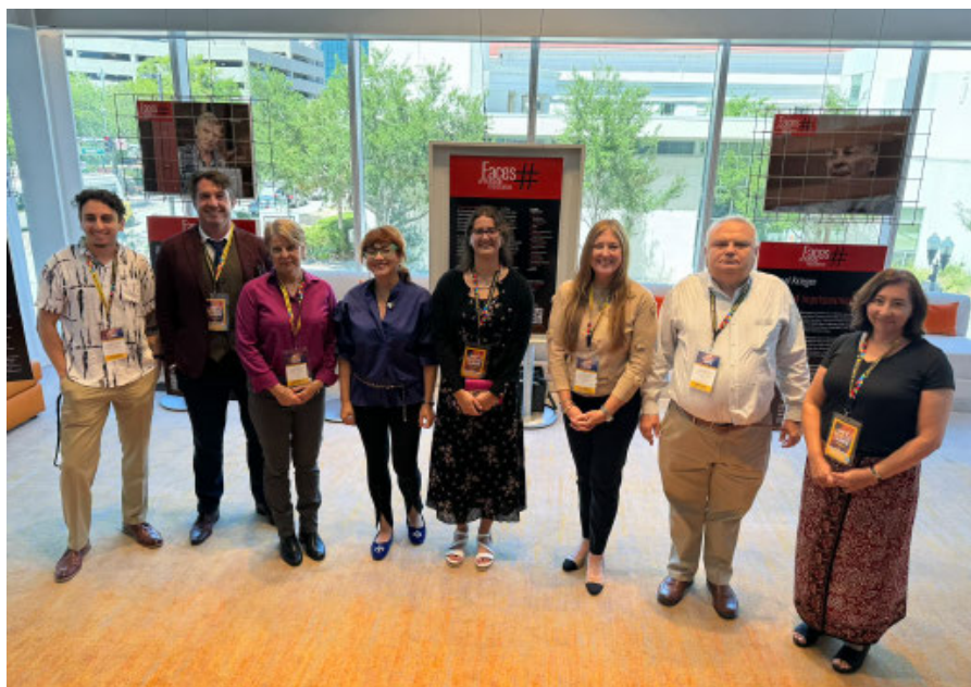
UCF faculty and students presented at UCF Celebrates the Arts.