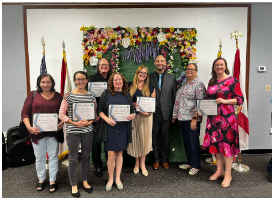
In April 2024, FPEP faculty were honored at the CFRC Award Ceremony.