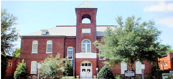
The center began as Sanford's first high school, and later became a grammar school in 1911

On August 13, UCF's new Public History Center held its first open house to meet with collaborators and supporters, and share plans for turning a 110-year-old Sanford school building into a learning laboratory for education, research and community engagement.