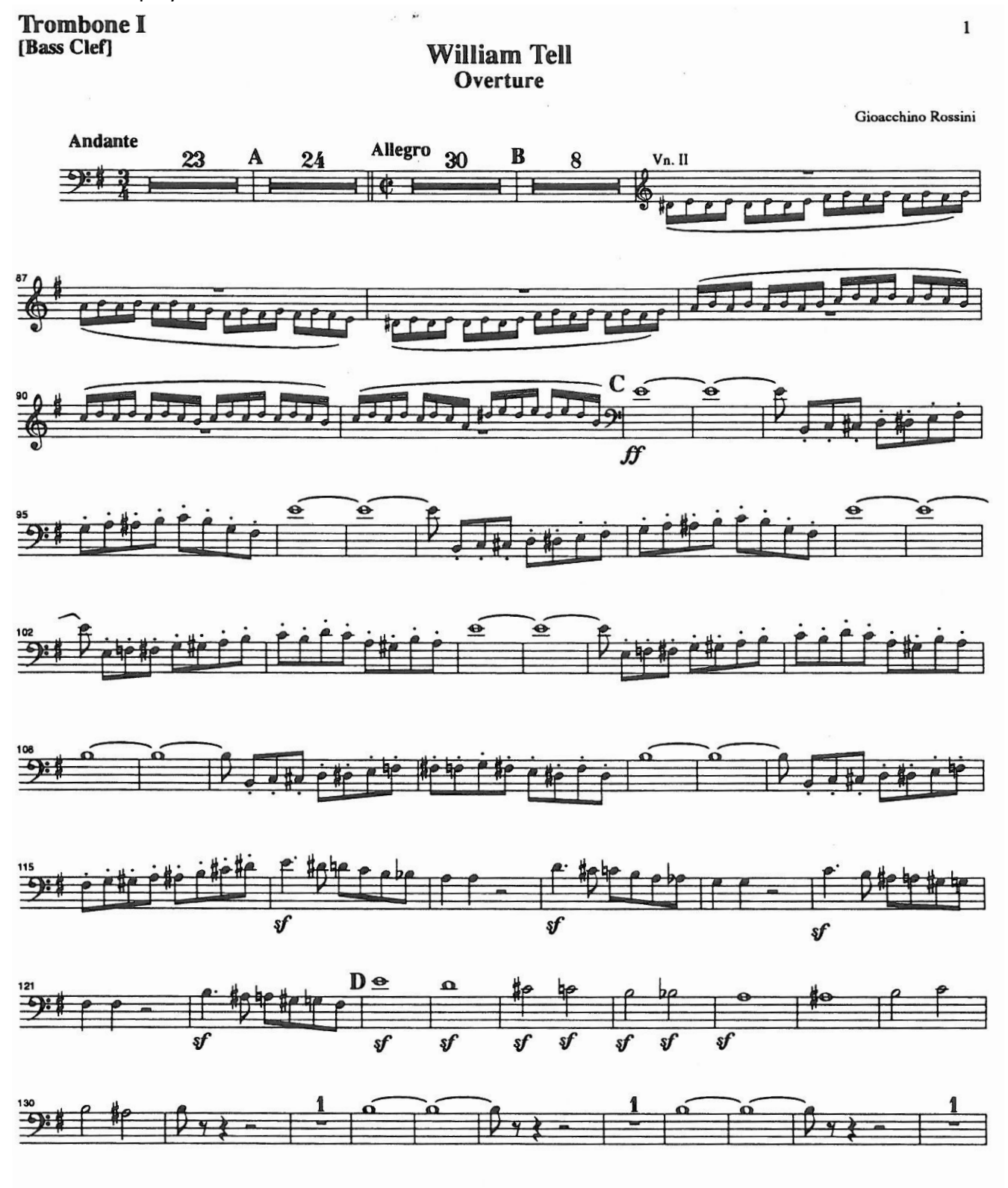
EXCERPT #1: play from Letter C to 9 measures after Letter D

TENOR TROMBONE EXCERPTS (use embedded links, if provided, to hear performances of each excerpt)